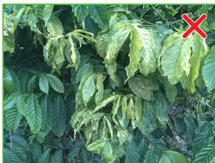
Herbicide effects on coffee trees