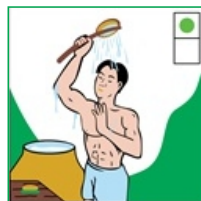
Wash and change clothes after using herbicides.