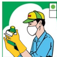
Read the label carefully before use