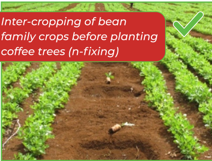
Inter-cropping of bean family crops before planting coffee trees (n-fixing)