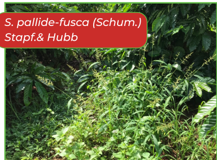
S. pallide-fusca (Schum.) Stapf. & Hubb