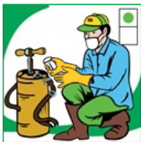
Wear PPEs when using herbicides