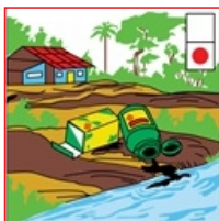
Do not dispose the left-over into soil or water.