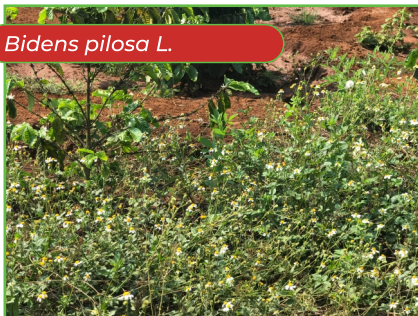
Bidens pilosa L.