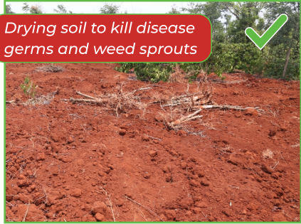
Drying soil to kill disease germs and weed sprouts