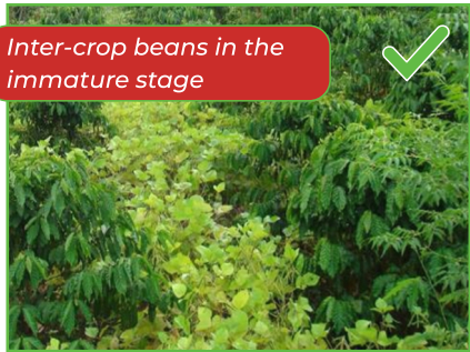
Inter-crop beans in the immature stage