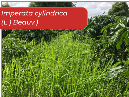
Imperata cylindrica (L.) Beauv.)