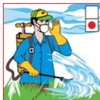
Select the proper nozzle and spray at low wind velocities to avoid drift