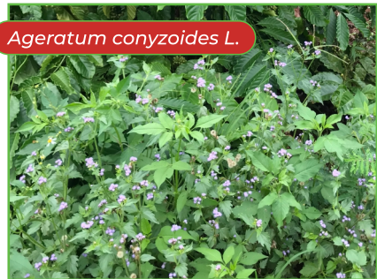
Ageratum conyzoides L.